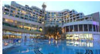
Daniel Dead Sea Hotel | ★★★★★

The hotel is within 1.2 m. from Petra. Guests can enjoy a continental breakfast with 5-star accommodation, plus an indoor pool. 24-hour assistance is available at the reception. All rooms have Wi-Fi access, tea and coffee making facilities, television, air conditioning, safe deposit box and a mini bar. The bathrooms are well equipped with bath/shower, hair dryer and complimentary toiletries.